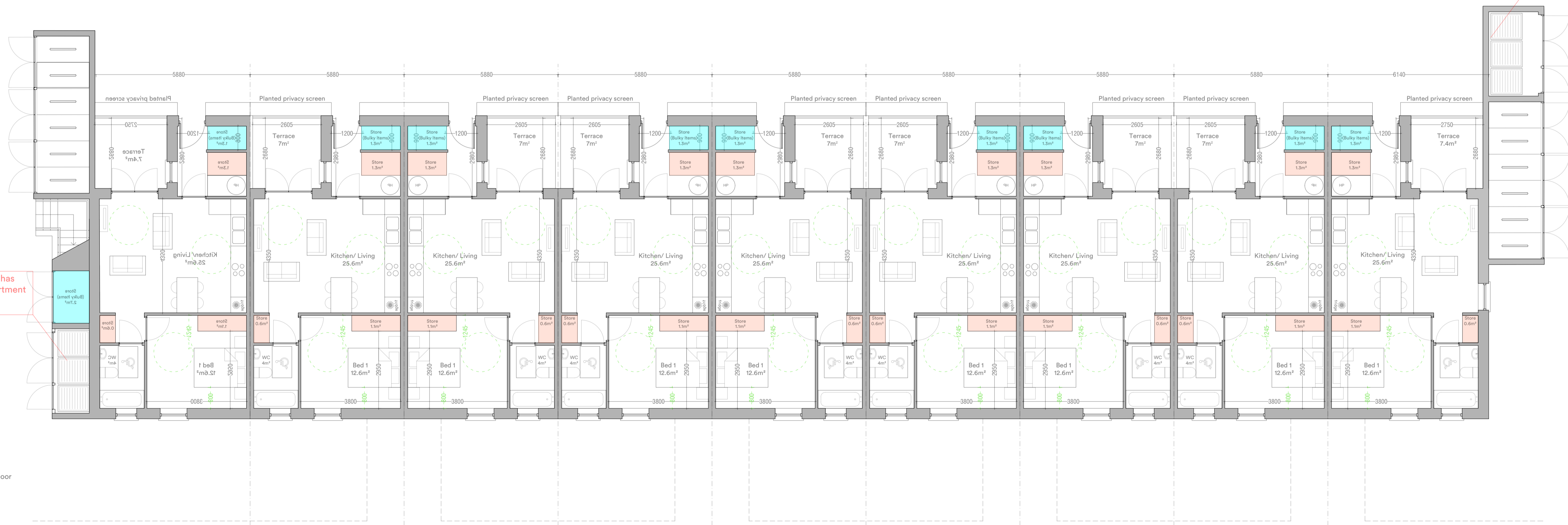
Duplex Block A Ground Floor

Response to RFI Item 1 (d) A communal 3 bin system has been provided for the apartment dwellings proposed