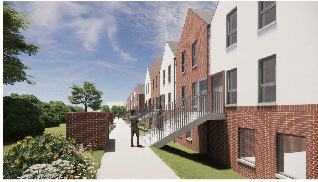
View of Bulky Storage to Front of Duplex Entrance