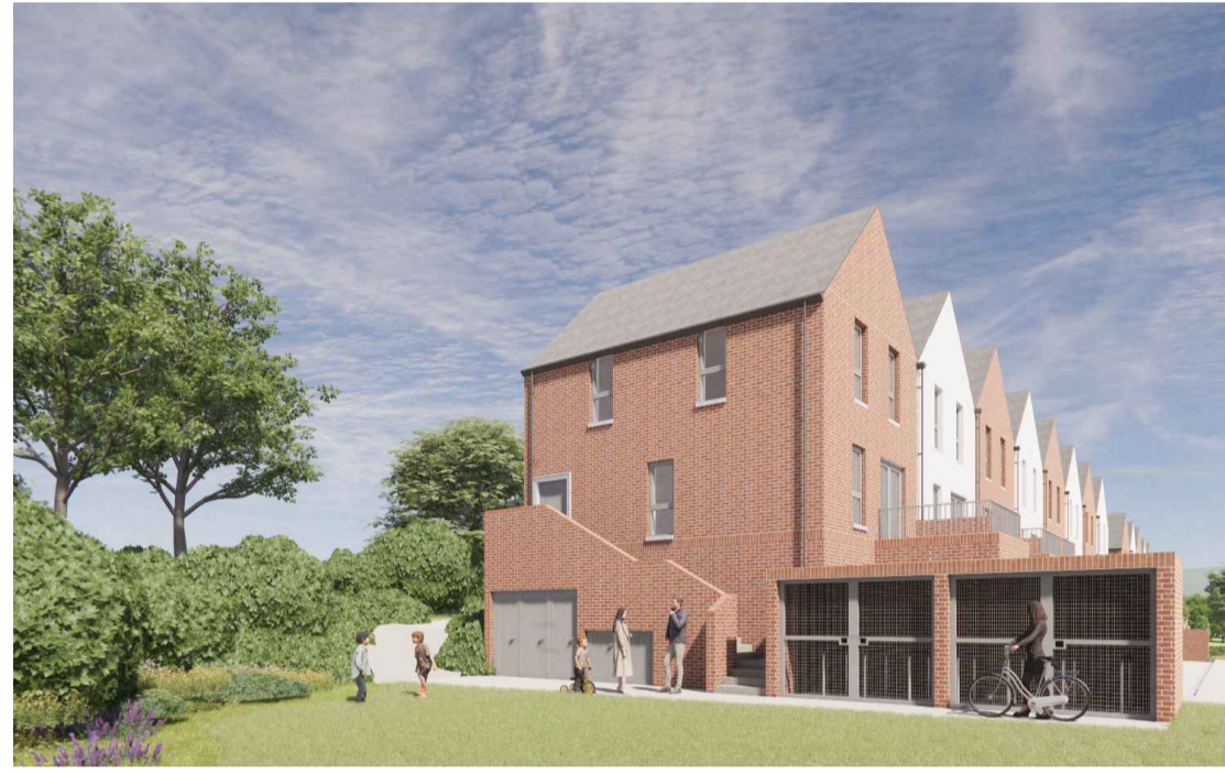
View of Bulky Storage to Side Access Duplex